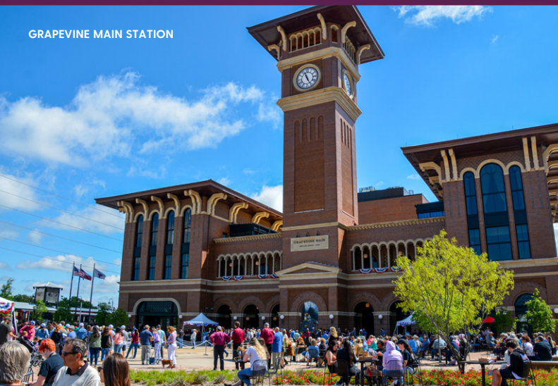
GRAPEVINE MAIN STATION