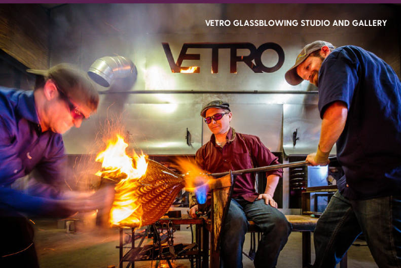
VETRO GLASSBLOWING STUDIO AND GALLERY