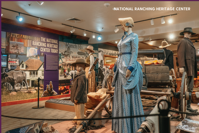
NATIONAL RANCHING HERITAGE CENTER