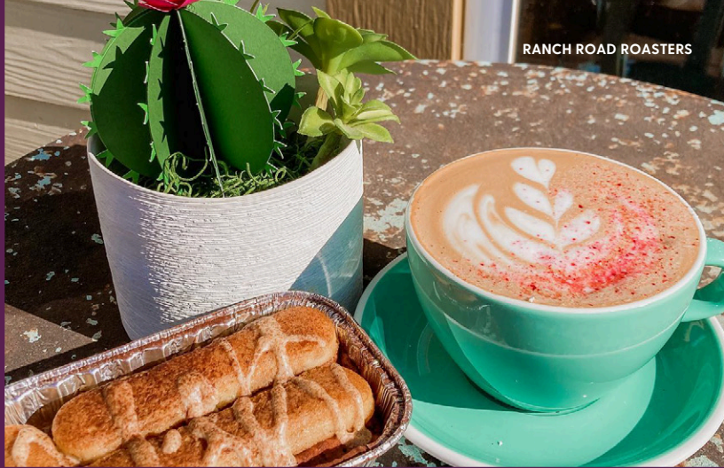
RANCH ROAD ROASTERS