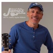
Sweet Baby James Tribute to James Taylor March 23, 7:30 p.m.