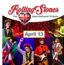
Satisfaction Tribute to the Rolling Stones April 13, 3 & 7:30 p.m.