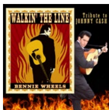
Walkin' the Line A Tribute to Johnny Cash March 2, 3 & 7:30 p.m.