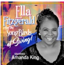
Ella Fitzgerald Tribute Show May 11, 3 p.m.