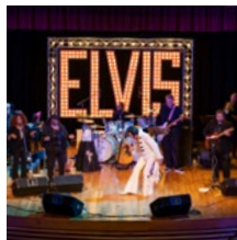
Lone Star King Festival 2024 May 24-26