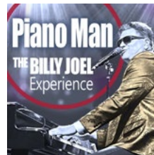
Piano Man The Billy Joel Experience June 22, 3 p.m.