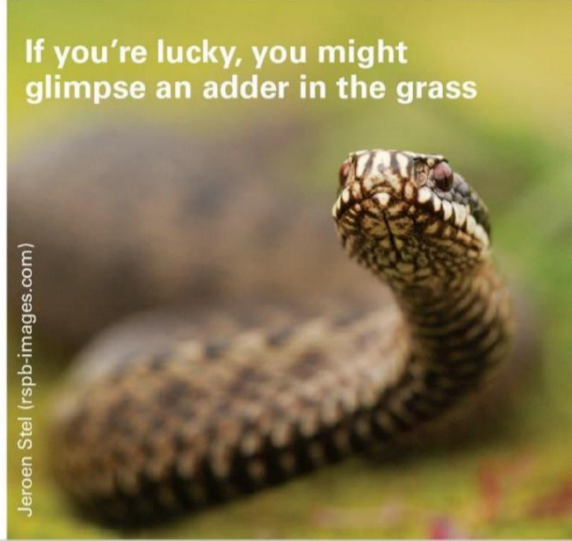
If you're lucky, you might glimpse an adder in the grass