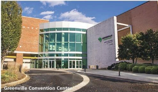
Greenville Convention Center

In a city of just over 72,000 residents, downtown Greenville boasts over 1,000 hotel rooms with over 9,000 in the greater Greenville area. The TD Convention Center has more than 200,000 sq. ft. of exhibition space, while venues like The Greenville County Museum and Fluor Field at West End offer unique settings for smaller gatherings.