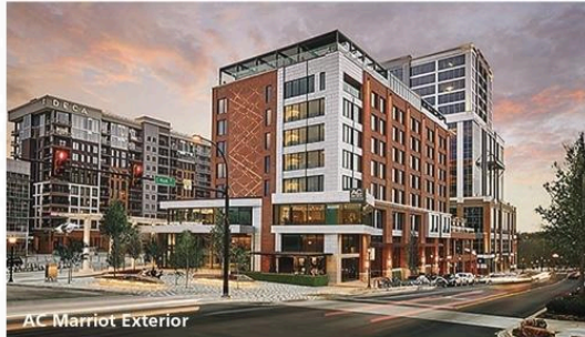
AC Marriott Exterior

include the expansion of the Greenville-Spartanburg International Airport and the development of the Prisma Health Swamp Rabbit Trail Extension, connecting downtown Greenville with nearby Travelers Rest.