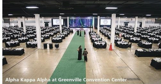
Alpha Kappa Alpha at Greenville Convention Center

Looking for a truly unique venue? Decorated with rich woods and