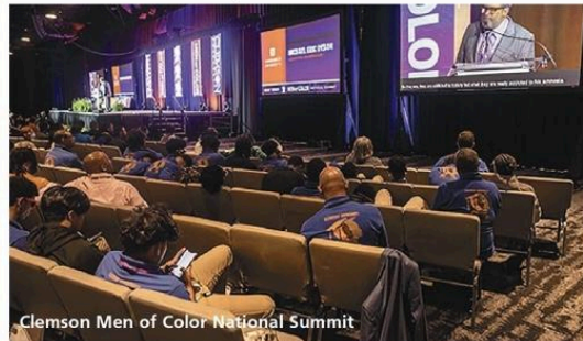
Clemson Men of Color National Summit

The Grand Bohemian has a total of 4,270 sq. ft. of unique meeting space with 1,900 sq. ft. in the Falls View Ballroom and 1,035 sq. ft. in the Reedy Falls Room. There are also two additional meeting rooms, breakout rooms, and serene outdoor spaces for events.