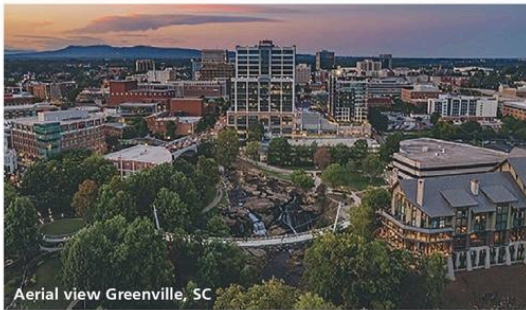
Aerial view Greenville, SC

A picturesque Southeast location, Greenville holds a wide variety of venues, facilities, amenities, accommodations, and restaurants plus several recreational and entertainment options. All this in a charming, eminently walkable and tree-lined downtown, packed with owner-operated shops, and well-suited for leisure, meeting, and convention visitors.