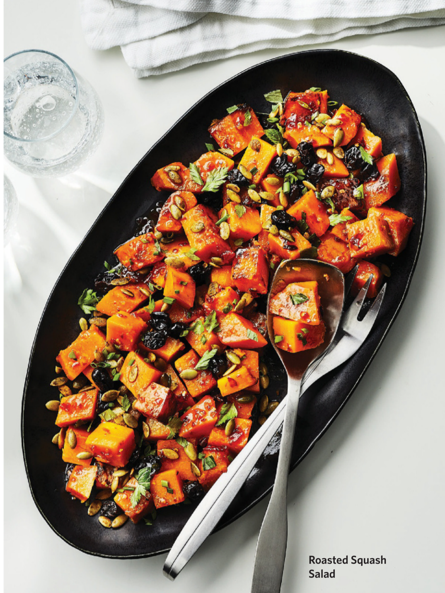
Roasted Squash Salad