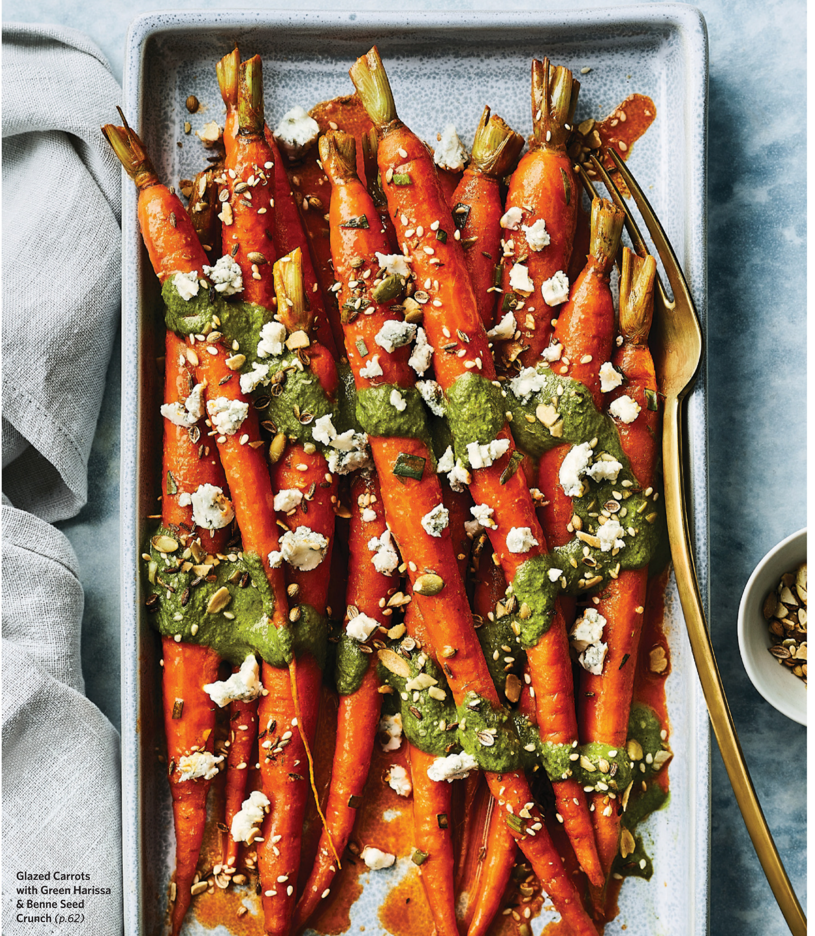
Glazed Carrots with Green Harissa & Benne Seed Crunch (p.62)