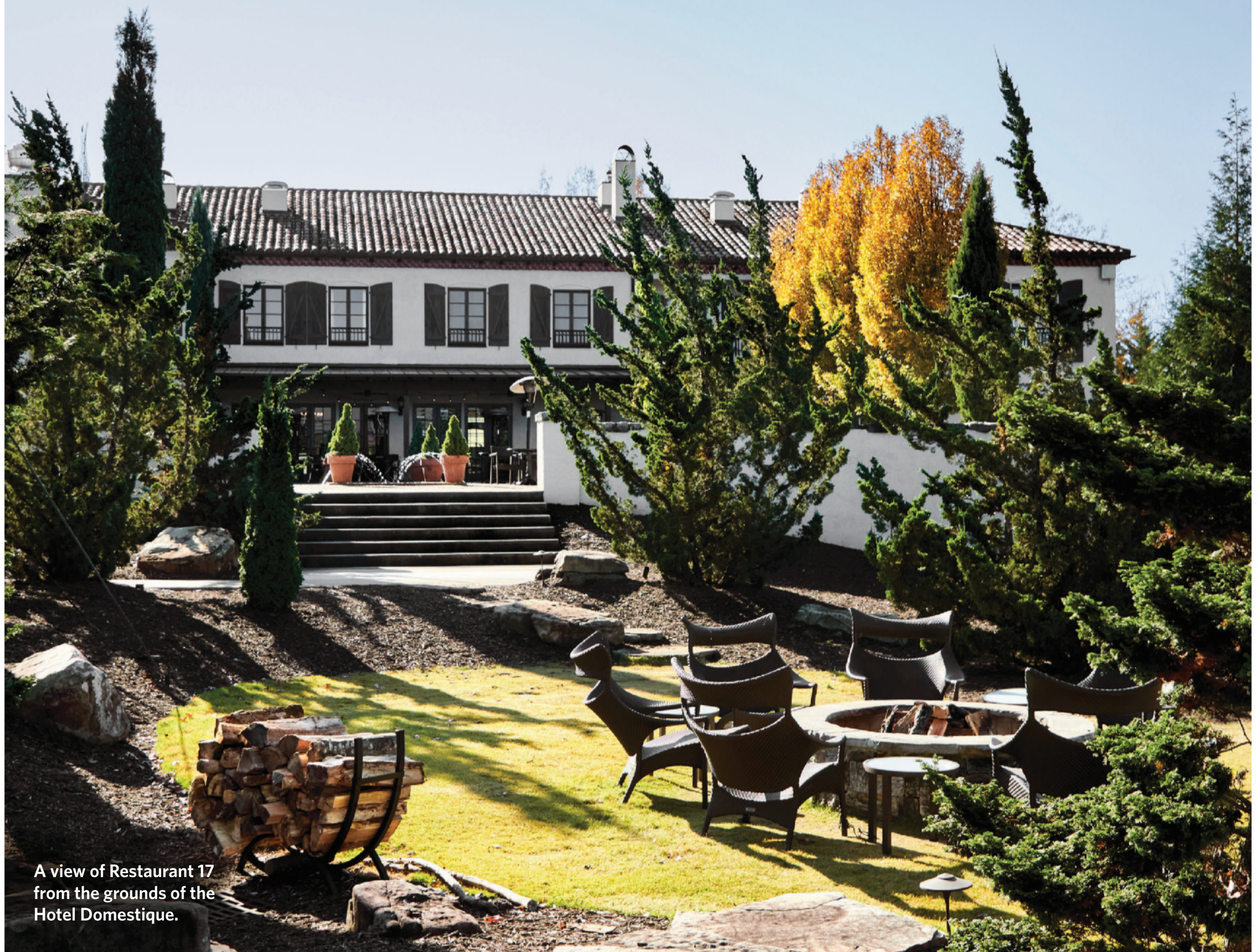
A view of Restaurant 17 from the grounds of the Hotel Domestique.

Carolina Bauernhaus Stop in for a pint at the beer garden of this truly local brewery to taste an ale made with local malt and grain, plus hops farmed by the brewers themselves.