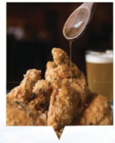
From top to bottom; The Westin Poinsette, Greenville; Soby's New South Cuisine