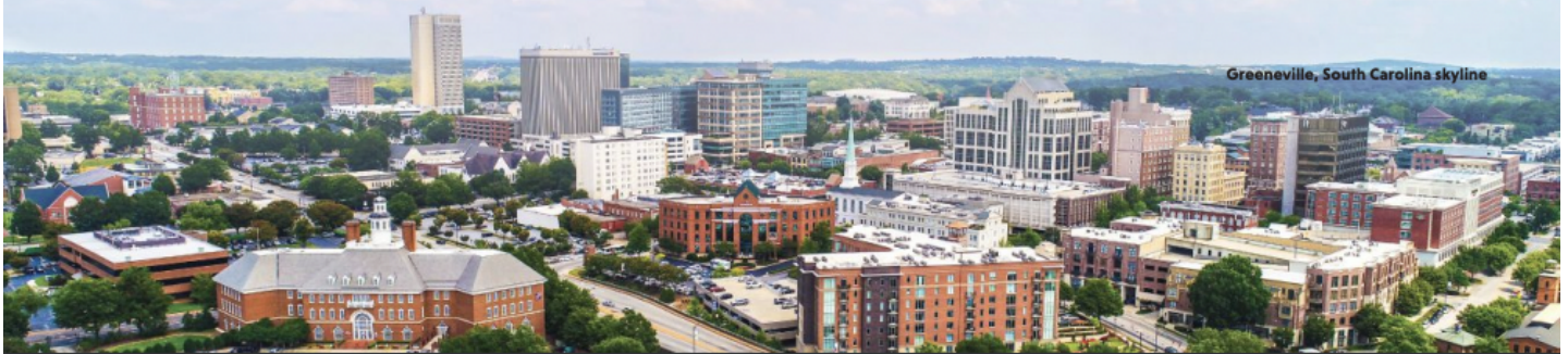
Greenville, South Carolina skyline