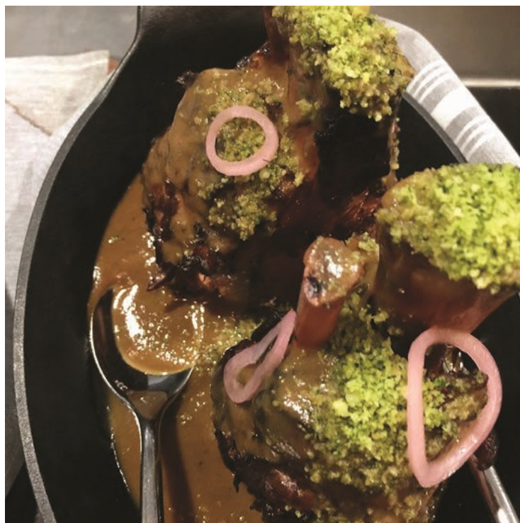
Cuisine is colorful and delicious in Spartanburg Upcountry restaurants where one of the chefs was named the South Carolina Chef Ambassador in 2017.