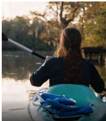
OUTDOOR ADVENTURE & NATURE