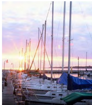
BEACHES, BOATING, & WATER