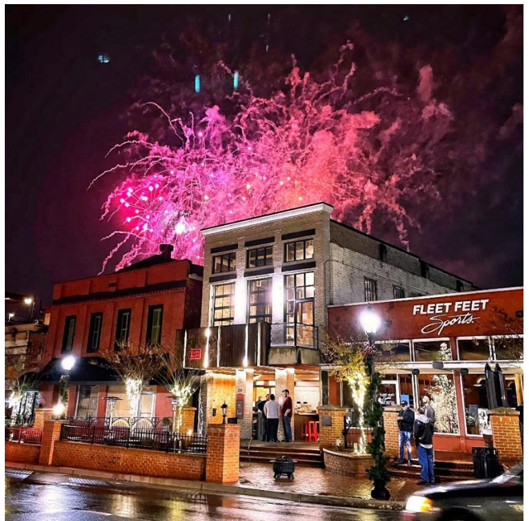
Fireworks at Merry Little Christmas 2020

The City of Lawrenceville is an Equal Opportunity Employer. All qualified resumes will receive consideration for employment regardless of race, color, religion, sex, national origin, disability or any other status protected by applicable Federal, State, or local laws.