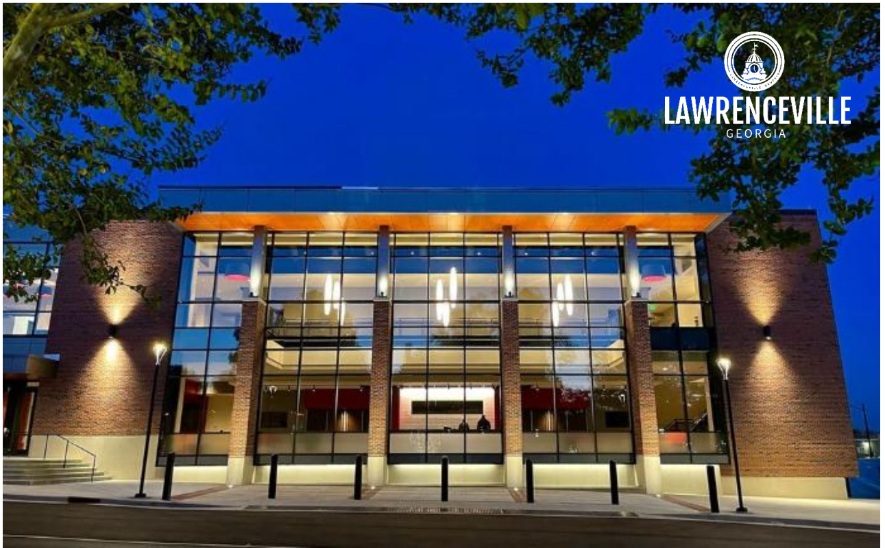
The Lawrenceville Arts Center