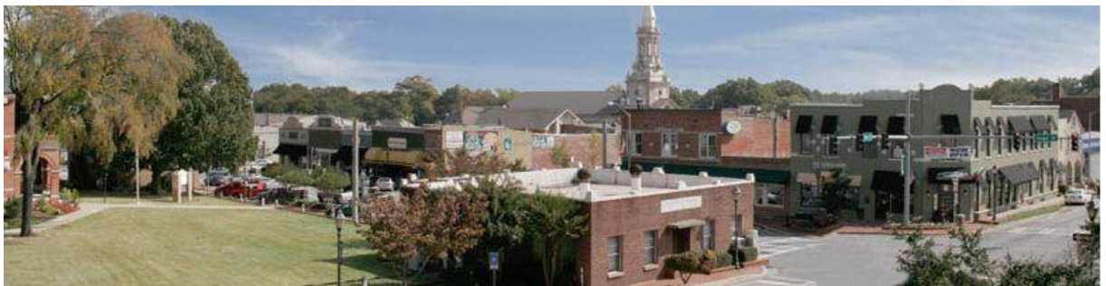
Lawrenceville Historic Square