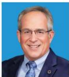
MAYOR DAVID STILL