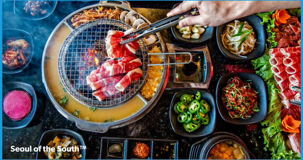
Seoul of the South™