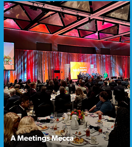
A Meetings Mecca