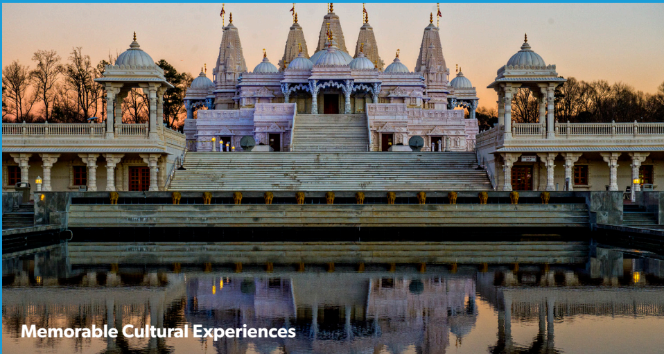
Memorable Cultural Experiences