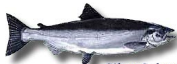
(Coho) Silver Salmon