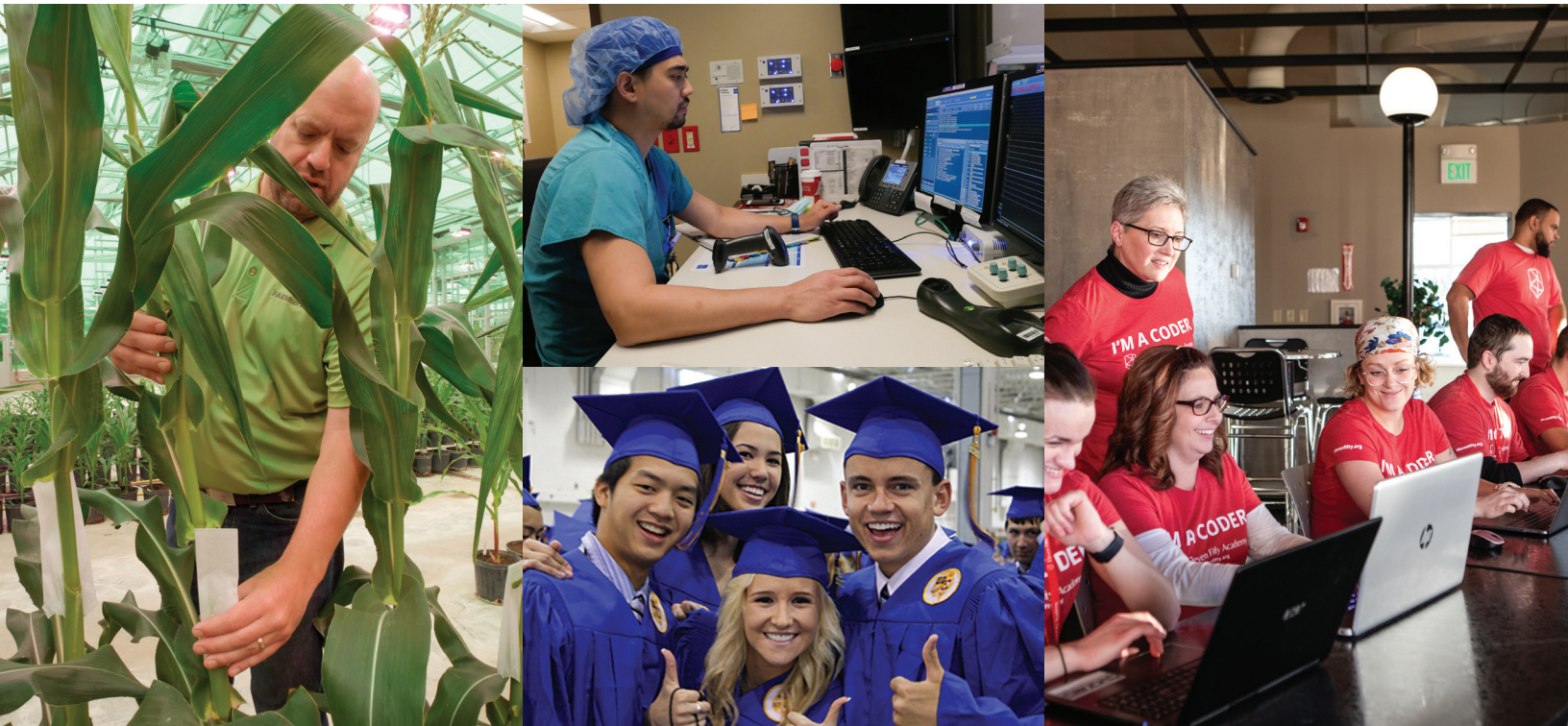
Chart a career path at more than 150 companies headquartered in the county, including insurance, finance, technology, agriculture, logistics and healthcare.

Hamilton County, a great place to live, work, learn and play, is strategically located in the Indianapolis Metropolitan area. Close to downtown Indianapolis and the award-winning Indianapolis International Airport, Hamilton County is listed as one of the fastest-growing counties in the country and has earned its national designation as a “Best Place to Live” and “Raise a Family.”