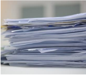
Clean Paper (Brochures, Flyers, Program booklets)