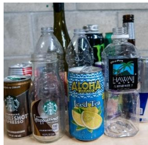
Plastic or Glass Bottles and Aluminum Cans