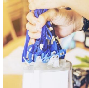
Lanyards and Name Badges