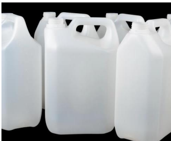
Non HI-5* Plastics