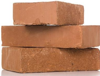
Construction Materials (Brick/Concrete)