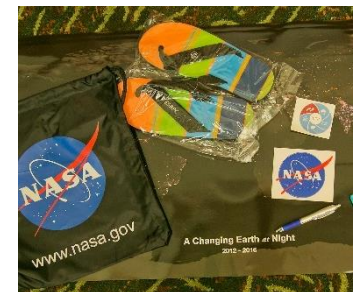
Miscellaneous Office Supplies, Trinkets, Décor, Bags, Craft Materials

* Hawai'i Deposit Beverage Container Program (HI-5)