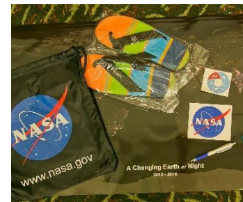
Miscellaneous Office Supplies, Trinkets, Décor, Bags, Craft Materials

* Hawai'i Deposit Beverage Container Program (HI-5)