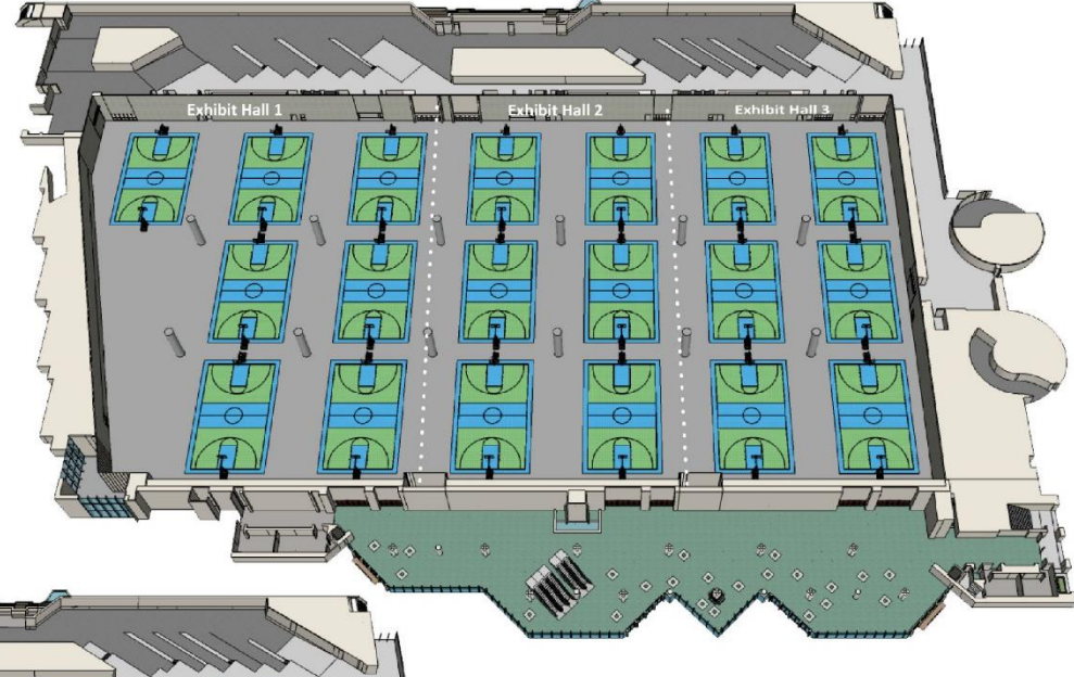
Exhibit Hall 3 = 6 courts

Exhibit Hall 1 = 7 courts Exhibit Hall 2 = 6 courts