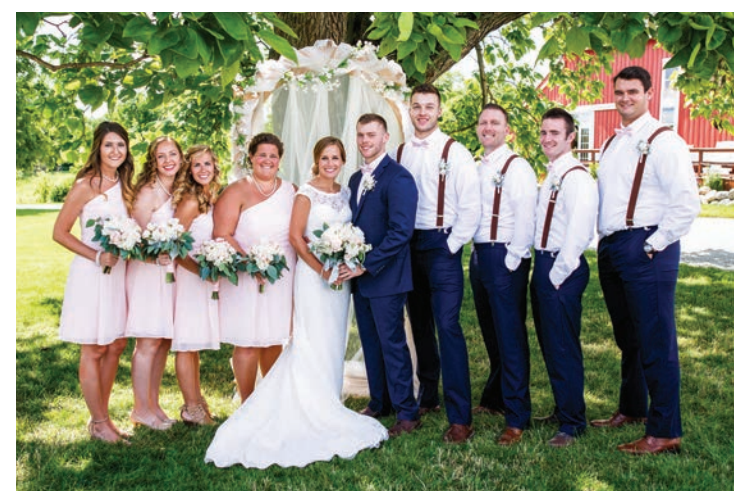
Venue: Avon Wedding & Event Barn

Visit Hendricks County is here to help you plan your big day! As local experts, we will provide everything you need to help your wedding planning go as smoothly as possible. We offer various free wedding services to make your wedding day a dream come true!