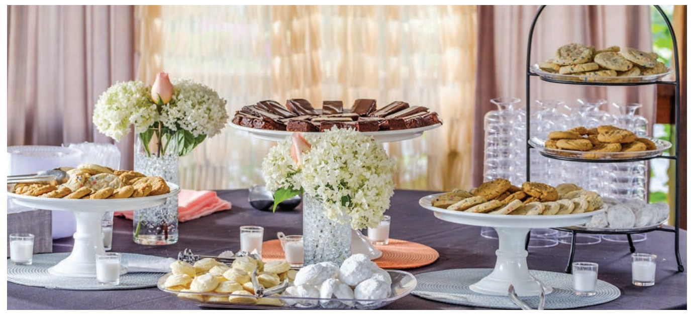
Venue: Avon Gardens