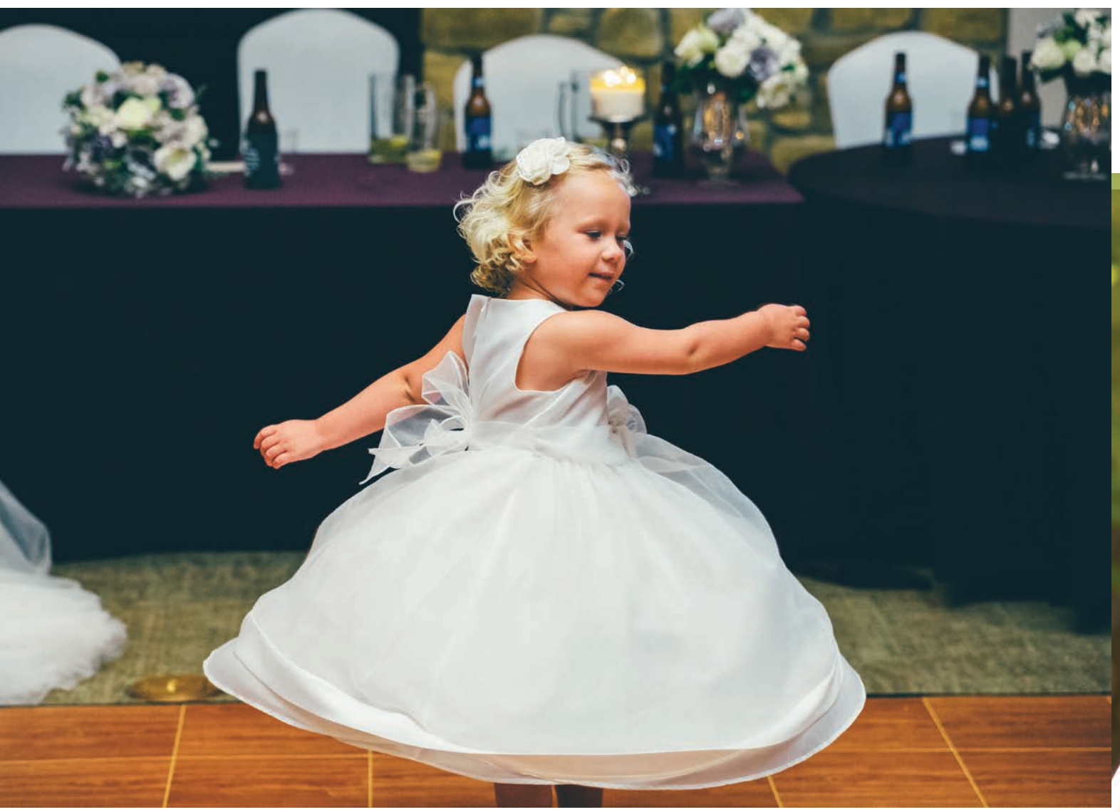
Venue: Washington Township Pavilion • Photographer: Hive and Honey Photography