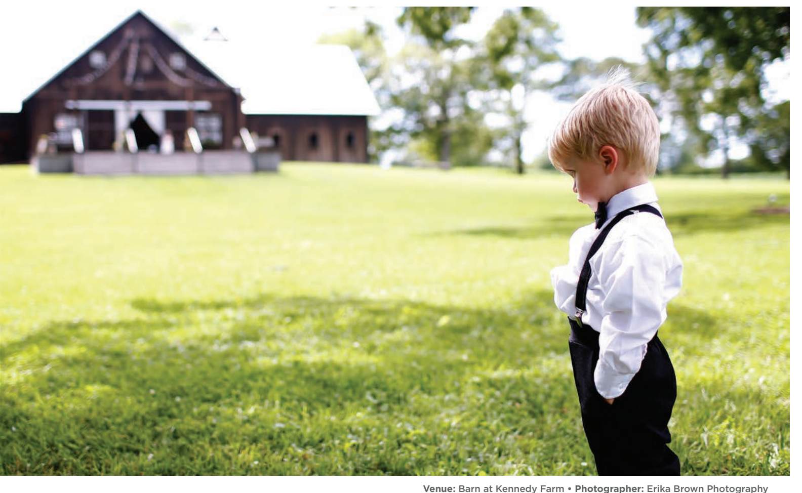
venue: Barn at Kennedy Farm