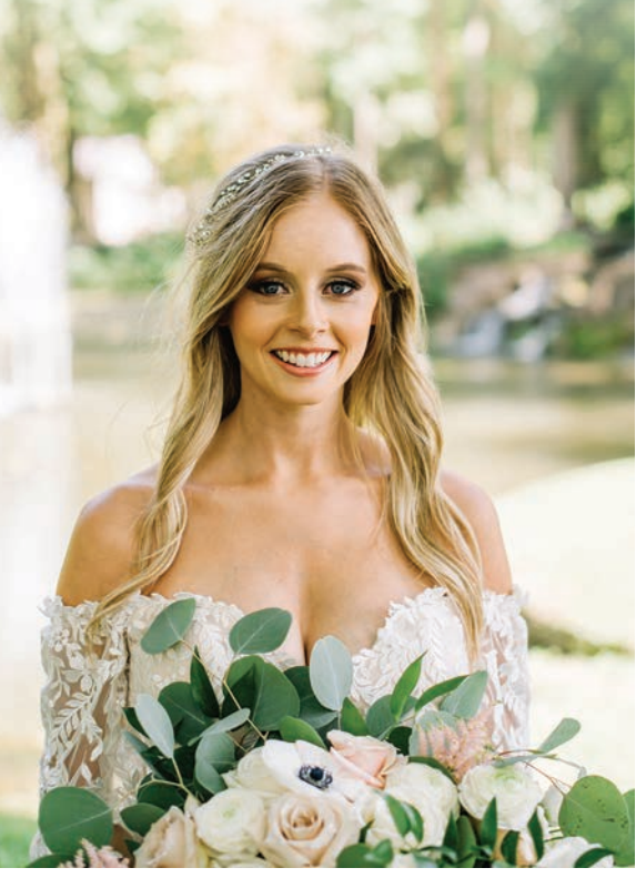
Venue: Lizton Lodge • Photographer: Clay House Photography

Visit Hendricks County is here to help you plan your big day! As local experts, we will provide everything you need to help your wedding planning go as smoothly as possible. We offer various free wedding services to make your wedding day a dream come true!