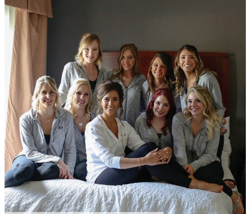
Hampton Inn & Suites, Indianapolis/Brownsburg