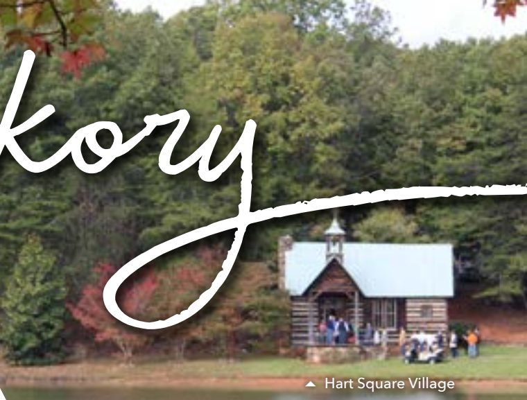
▲ Hart Square Village

▲ Experience North Carolina's first Bourbon since Prohibition and traditional Moonshine at Seventeen Twelve Spirits . Whiskey from the salvage divers by trade at Defiant Distillery and Warehouse Distillery with their Maple flavored Whiskey. As craftsmen by nature and trade for many this is a family tradition that has continued into a new age passion.