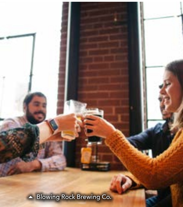
▲ Blowing Rock Brewing Co.

▲ Hart Square Village has the world's largest collection of historic log structures dating back to the 1800's. This unique working village opens the door back into the 1800's with events like Founder's Day BBQ, Hart Square Festival & a Hart Square Christmas complete with a candle light service in the chapel.