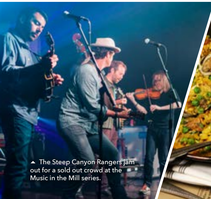
▲ The Steep Canyon Rangers jam out for a sold out crowd at the Music in the Mill series.