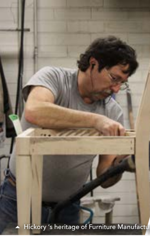
▲ Hickory 's heritage of Furniture Manufacturing continues today