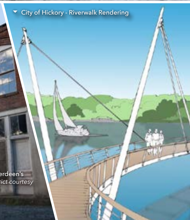
▼ City of Hickory - Riverwalk Rendering