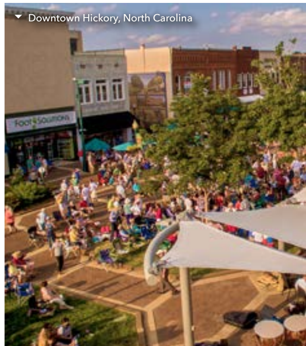
▼ Downtown Hickory, North Carolina

▶ National Geographic ranked Hickory in the top 30 best small cities in the United States noted for hipster-friendly offerings. Downtown hosts events like Oktoberfest, Hickory Hops Festival, Art Crawls Original Music Series and more.