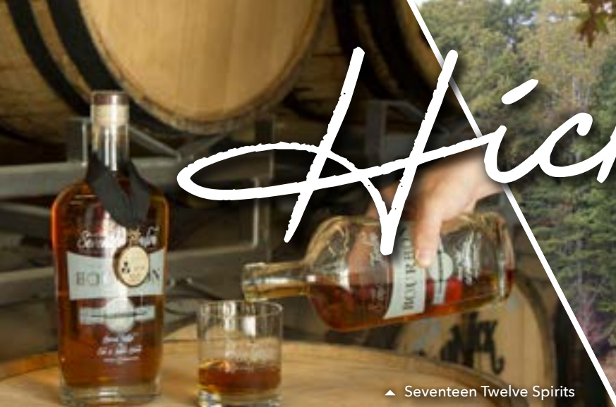
▲ Seventeen Twelve Spirits