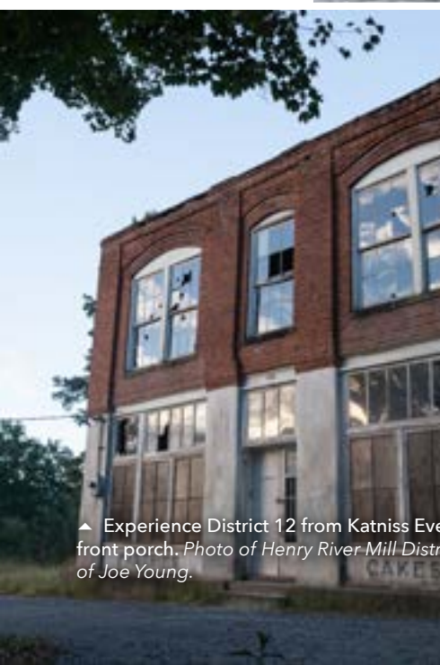
▲ Experience District 12 from Katniss Everdeen's front porch. Photo of Henry River Mill District courtesy of Joe Young.

◀ The Riverwalk and Citywalk projects are just a couple of ways that Hickory is offering more walkable ways to explore our city. The City Walk which is currently under construction will allow access from our Downtown Hickory area to Lake Hickory.