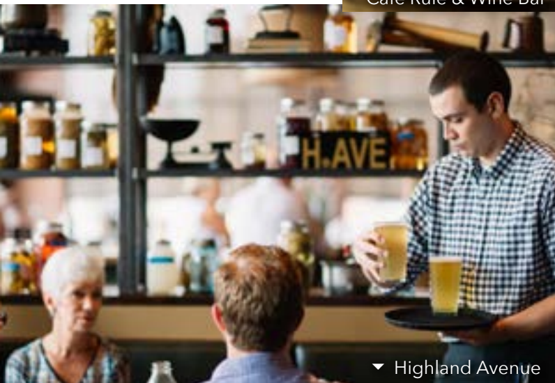
▼ Highland Avenue