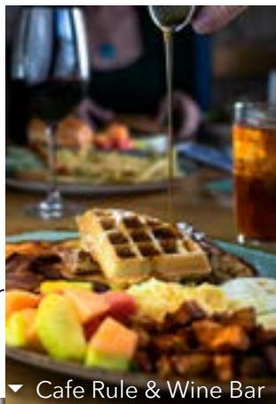
▼ Cafe Rule & Wine Bar

Our Convention Center & Visitors Bureau and Hickory Metro Sports Commission are happy to assist with planning and organizing your next great sporting event!