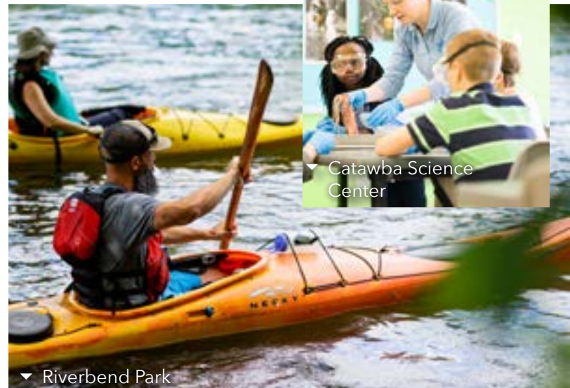
▼ Catawba Science Center