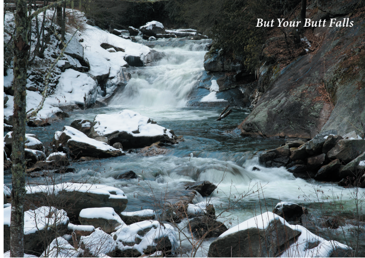
Bust Your Butt Falls