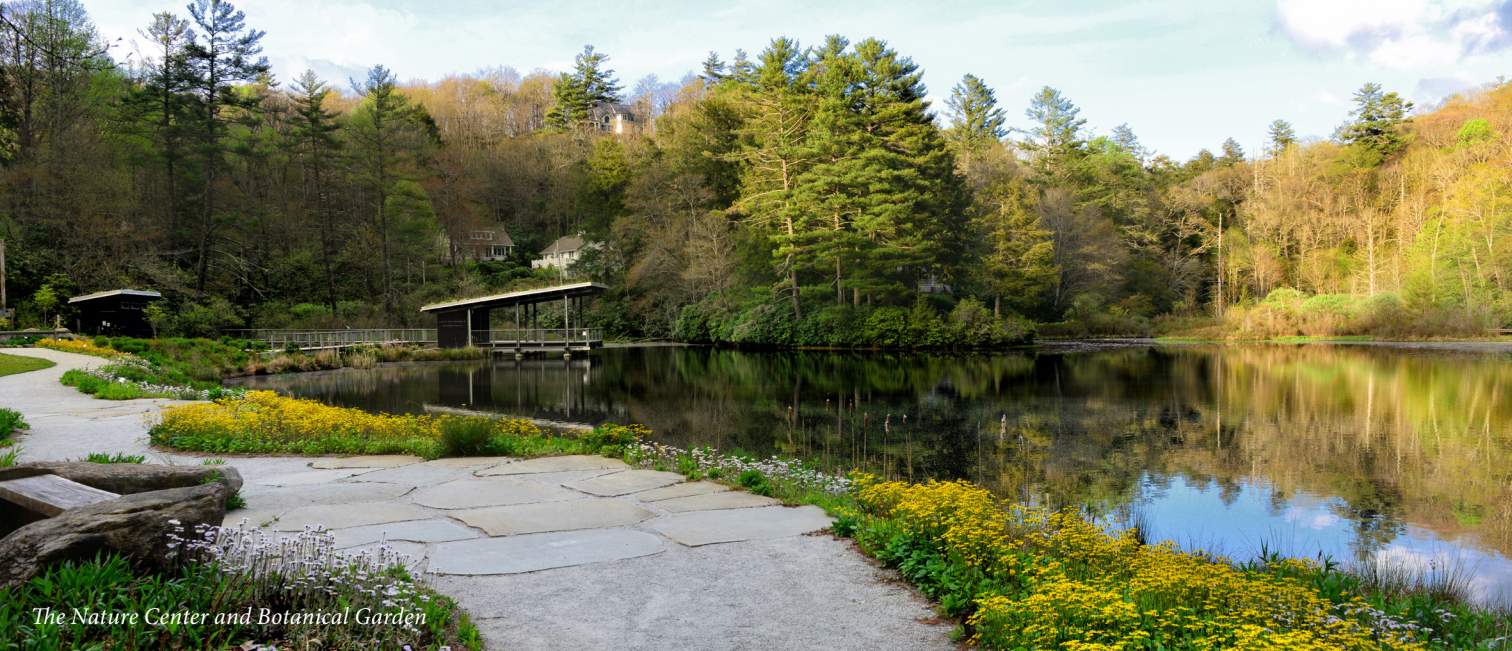
The Nature Center and Botanical Garden