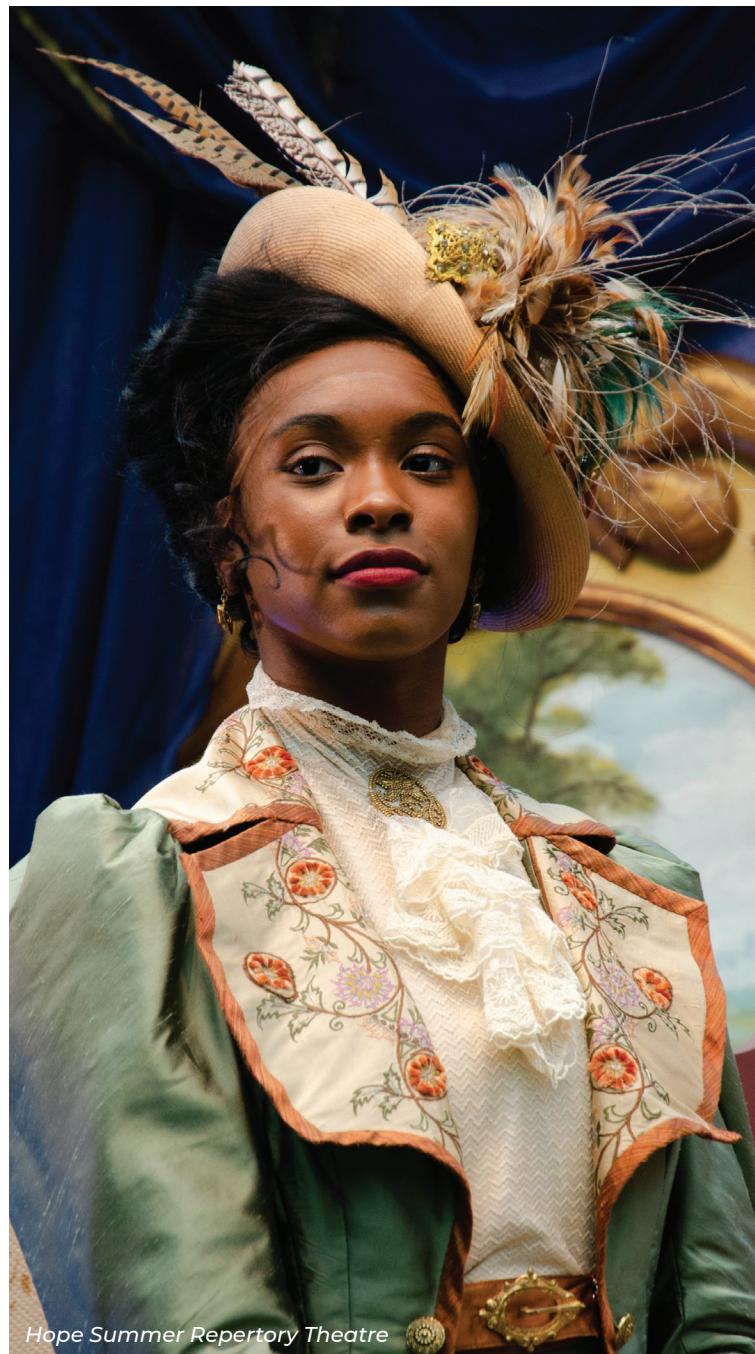
Hope Summer Repertory Theatre

If you visit in the summer, you'll have the best of both local and national talent from this professional theatre company. Lively musicals, classic dramas, and hilarious comedies delight audiences in rotating repertory.