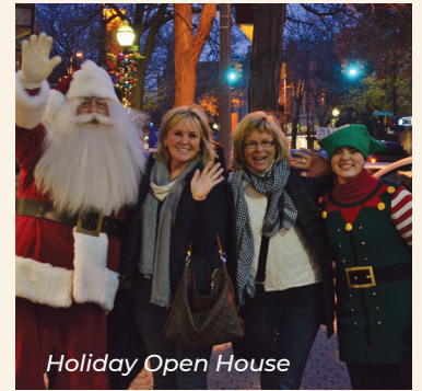
Holiday Open House