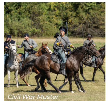
Civil War Muster