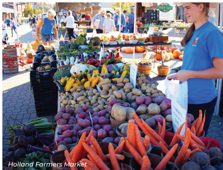
Holland Farmers Market