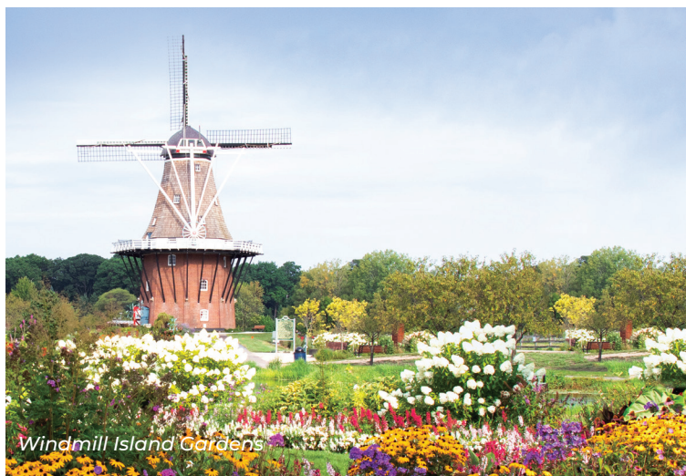
Windmill Island Gardens