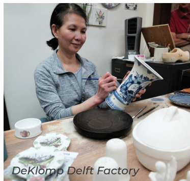
DeKlomp Delft Factory