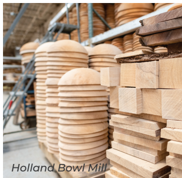
Holland Bowl Mill