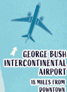
GEORGE BUSH INTERCONTINENTAL AIRPORT 18 MILES FROM DOWNTOWN