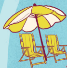
GALVESTON 50 MILES FROM DOWNTOWN