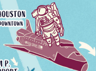
WILLIAM P. HOBBY AIRPORT 10 MILES FROM DOWNTOWN