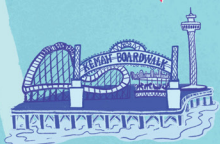
KEMAH 30 MILES FROM DOWNTOWN