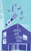
WHITE OAK MUSIC HALL