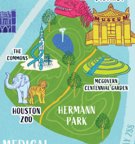
McGOVERN CENTENNIAL GARDEN