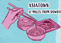
12 MILES FROM DOWNTOWN