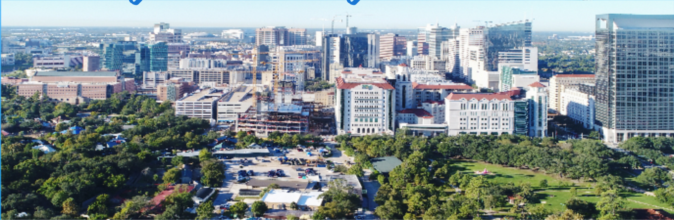
TEXAS MEDICAL CENTER 4.5 miles from Downtown Convention Campus