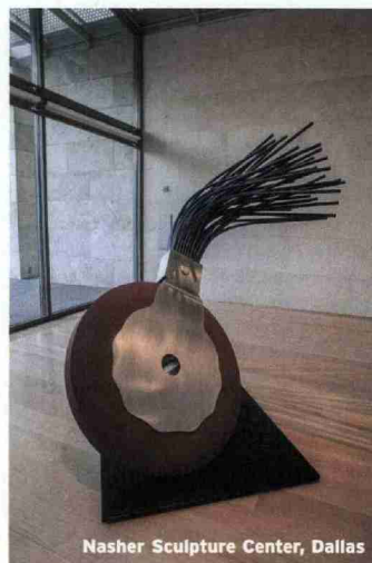
Nasher Sculpture Center, Dallas

San Antonio hosts a variety of performing arts organizations. Symphony concerts occurred in the town as early as the 1880s, but the first orchestra wasn't organized until 1939. Today, the San Antonio Symphony plays at the Tobin Center for Performing Arts. The Guadalupe Theatre presents theater, music, dance and film performances with a focus on Latino, Chicano/a, and Native American experiences. The theater is home to the Guadalupe Dance Company and CineFestival, the nation's longest running Latino film festival. The Majestic and Empire theaters present a variety of local and touring music and dance events.