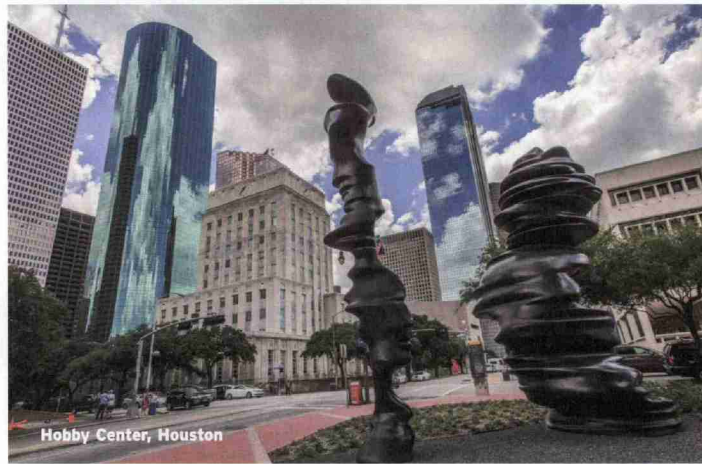
Hobby Center, Houston

Houston 's art museums are also centrally located in the Houston Museum District, which is home to 19 institutions of arts, science and culture, plus the Houston Zoo. A whole day could be spent perusing the vast collections of the Museum of Fine Arts, Houston—one of the largest museums in the country, with items dating from ancient times to today. The Menil Collection exhibits