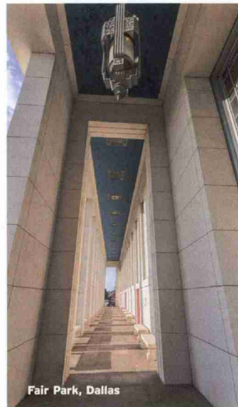
Fair Park, Dallas

Art abounds in additional museums throughout the state. Texas Artists Museum in Port Arthur spotlights artists in the Golden Triangle area and beyond with exhibits that change every three months. With collections comprised primarily of 19th- to 21st-century fine, folk and decorative arts, Beaumont's Art Museum of Southeast Texas hosts up to 10 exhibitions a year. In Orange , the Stark Museum of Art's