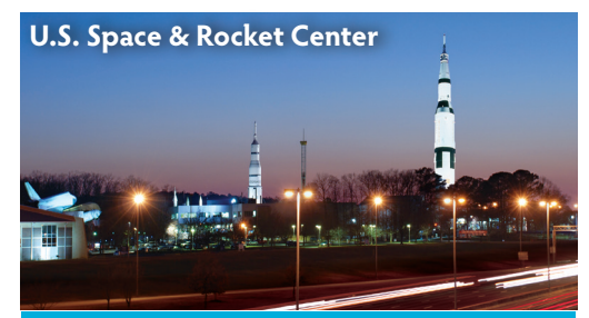
Earth's largest spaceflight museum & home to world-renowned Space Camp<sup>®</sup>

A mixture of high-tech cool and southern culture, Huntsville brings art and science together in one sublime city.