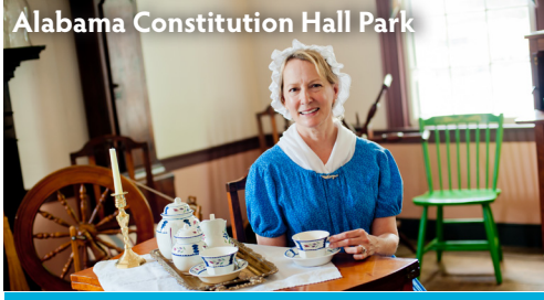
Living history museum and the site where Alabama's state constitution was signed in 1819