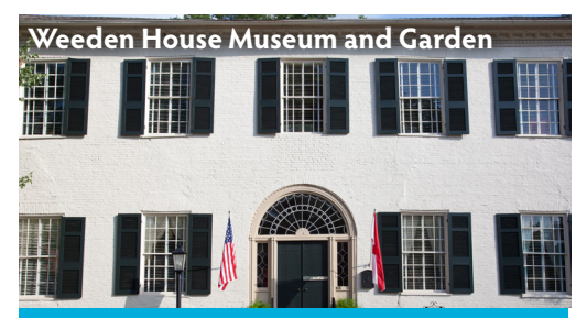
The oldest house in the state functioning as a public museum