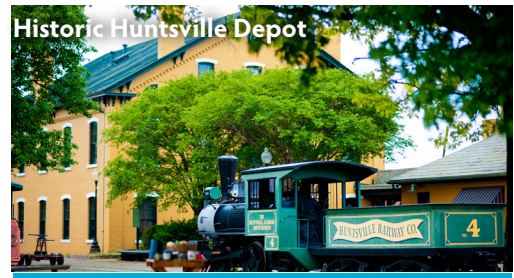
Oldest railroad depot in the state where Civil War-era graffiti can still be seen on the walls