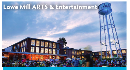
Largest, privately-owned arts facility in the United States