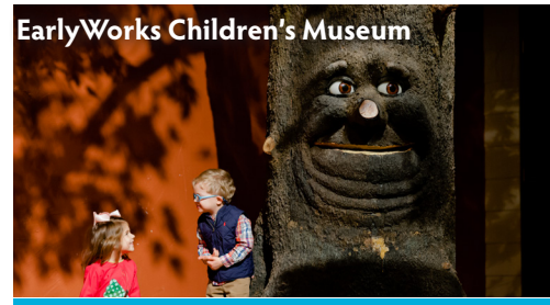
Hear a story from a talking tree, sail on a steamboat, and let the kids get hands-on with history