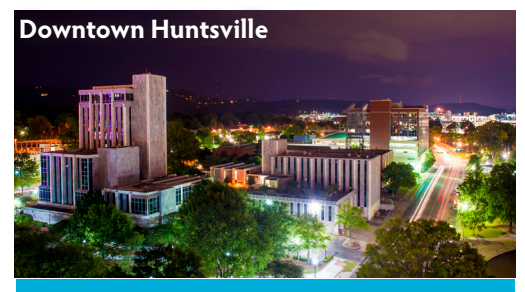
Built on a series of underground caves, astronaut Alan Shepard's footprints can be found in the sidewalk here