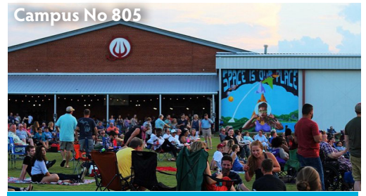
An old school turned into the ultimate adult playground with beer, axe-throwing, and more