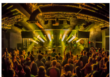
Discover bands before they get big at Hi-Fi

Visit these clubs for up-and-coming artists and the best in local talent.