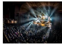
Old National Centre