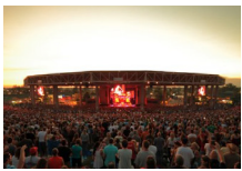
Ruoff Home Mortgage Music Center

Catch the hottest touring acts at these Indy theatres and outdoor venues.