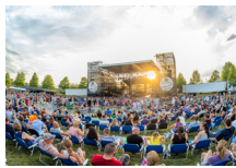
The Lawn at White River State Park