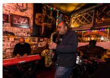
Jazz is always in style at the Chatterbox