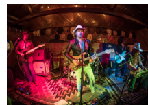
Honky Tonk at Dukes Indy