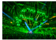
Bankers Life Fieldhouse