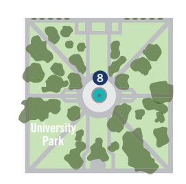
New York St.