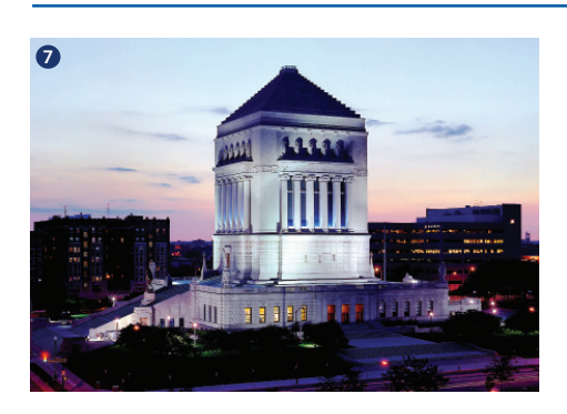
VETERANS MEMORIAL PLAZA

Completed in 1930, it honors all Hoosier veterans and is today one of downtown's most popular venues for outdoor events, including the annual Independence Day festival.