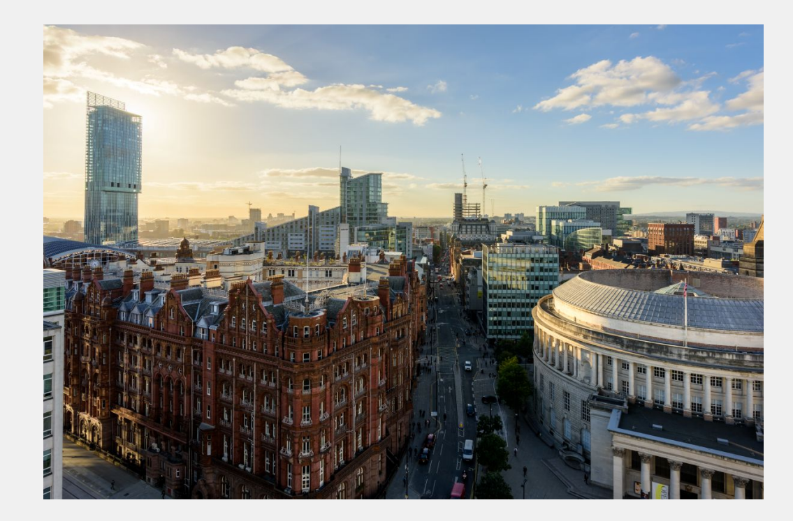
Manchester named one of Europe's best cities for 2025

The Greater Manchester delegation made a powerful case for the city-region's growth potential across two days in Leeds at UKREiiF 2025. The MIDAS team connected with investors, developers, and policymakers to showcase the wealth of opportunities that continue to define our city-region as a national leader in inclusive growth and innovation.