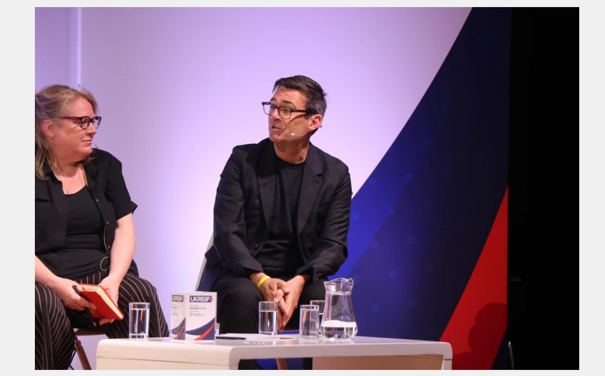
Greater Manchester Makes Its Mark at UKREiiF 2025

The Greater Manchester delegation made a powerful case for the city-region's growth potential across two days in Leeds at UKREiiF 2025. The MIDAS team connected with investors, developers, and policymakers to showcase the wealth of opportunities that continue to define our city-region as a national leader in inclusive growth and innovation.