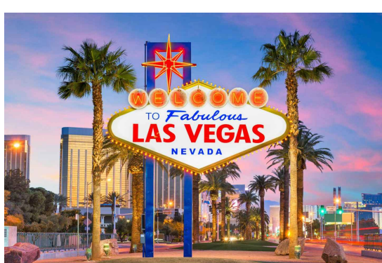
Direct flights from Manchester to Las Vegas return