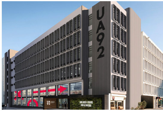
UA92 expands with launch of city centre Business School