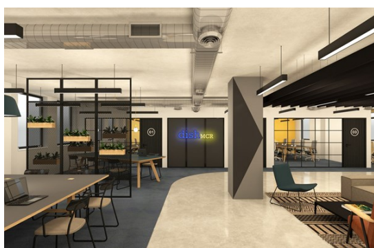
Cisco launches skills programmes to help improve the Cybersecurity resilience of Greater Manchester