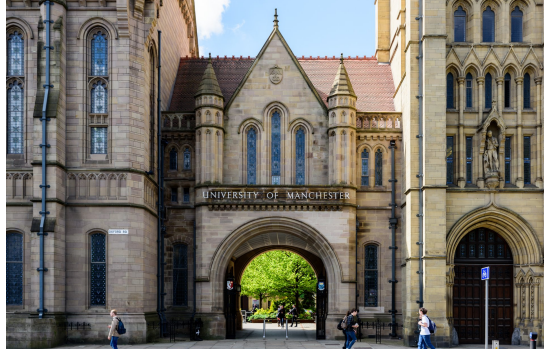
University of Manchester named number 1 in the UK for social and environmental impact