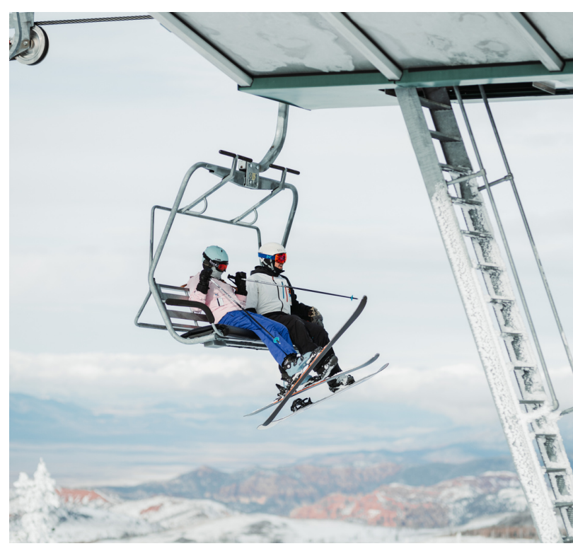
Red rock views from the lift at Brian Head Resort