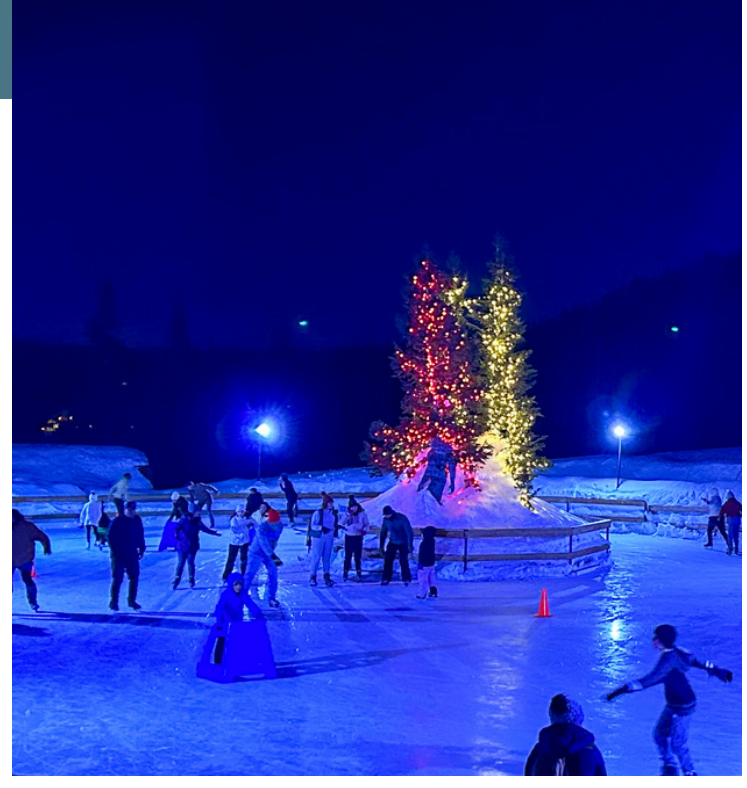
Gliding through the trees at Brian Head Ice