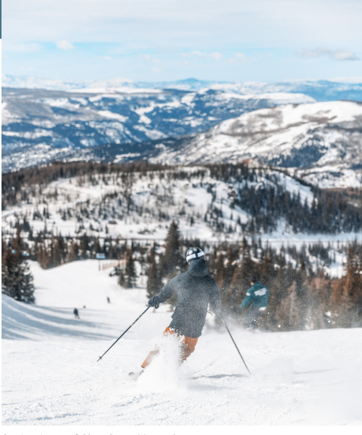
On the slopes of Giant Steps Mountain