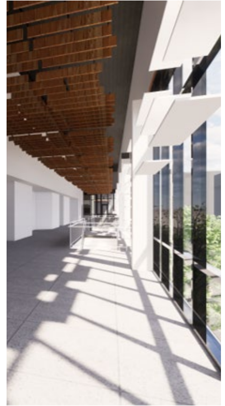
Second floor prefunction

Work continues in partnership with the City of Ithaca, Downtown Ithaca Alliance, Tompkins Chamber Foundation, Downtown Ithaca Local Development Corporation, and hotel partners.