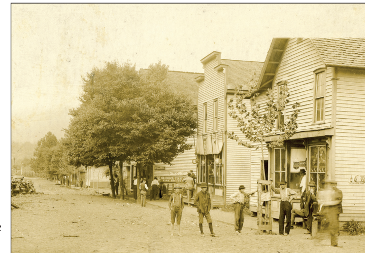
Above: Looking down Dillsboro's Front Street Below: Dillsboro in the early 1900s

Dillsboro has been a tourist town since 1886 when visitors began to arrive by train and spend several weeks. Word spread about the cool summers and beautiful mountain scenery.