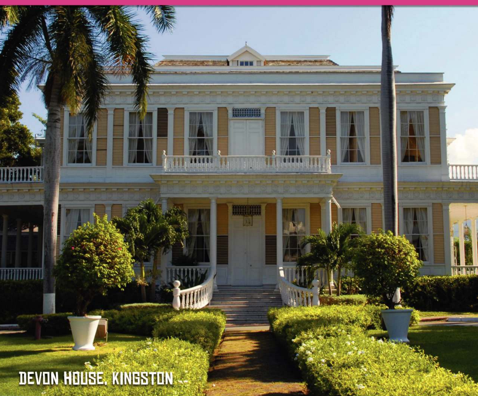
DEVON HOUSE, KINGSTON