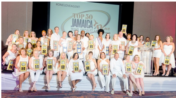
Participants from last year's White Affair

In addition to the annual white affair, agents are rewarded for each booking logged. For further information visit www.jamaicarewards.co.uk