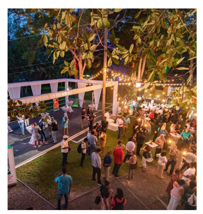
ABOVE: Final Night Event at Good Hope