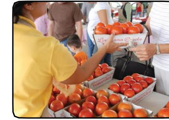
Farmers & Fisheries Market