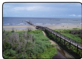
Grand Isle Beach