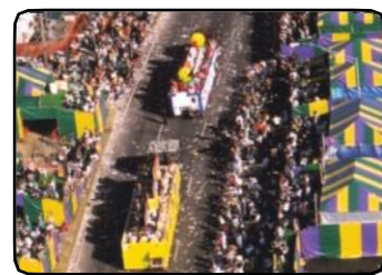
Mardi Gras Grandstand