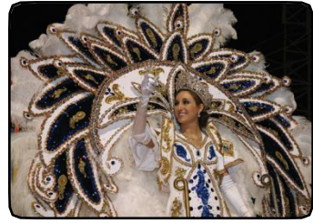
Mardi Gras Queen