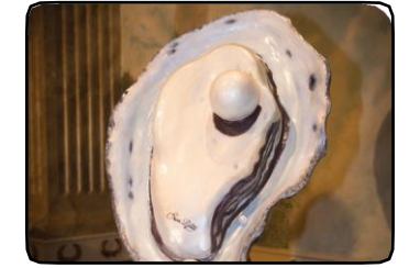
Lafitte Oyster Sculpture