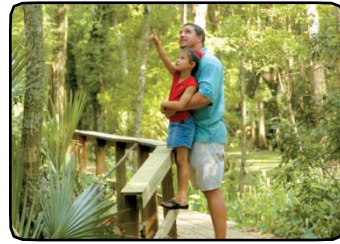
Jean Lafitte National Park

Boardwalks over the swamp get you up close & personal with nature in all its glory.