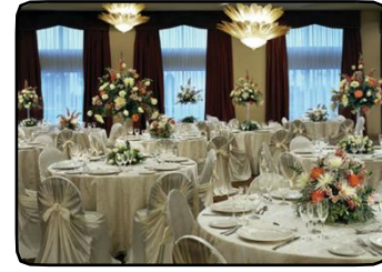
Small Intimate Venues