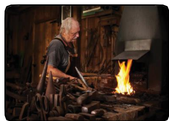
Historic Gretna blacksmith

Sala Avenue is the city's Historic District and is currently being redeveloped for the enjoyment of locals and visitors. The long awaited Westwego Farmers and Fisheries Market, opened summer 2008, features fresh produce, seafood, arts and crafts Wednesday and Saturday from 9am to 1pm. The Westwego Historic Museum is located in the century-old fisherman's exchange building and features an old time hardware store and completely furnished upstairs living quarters with antique furniture.