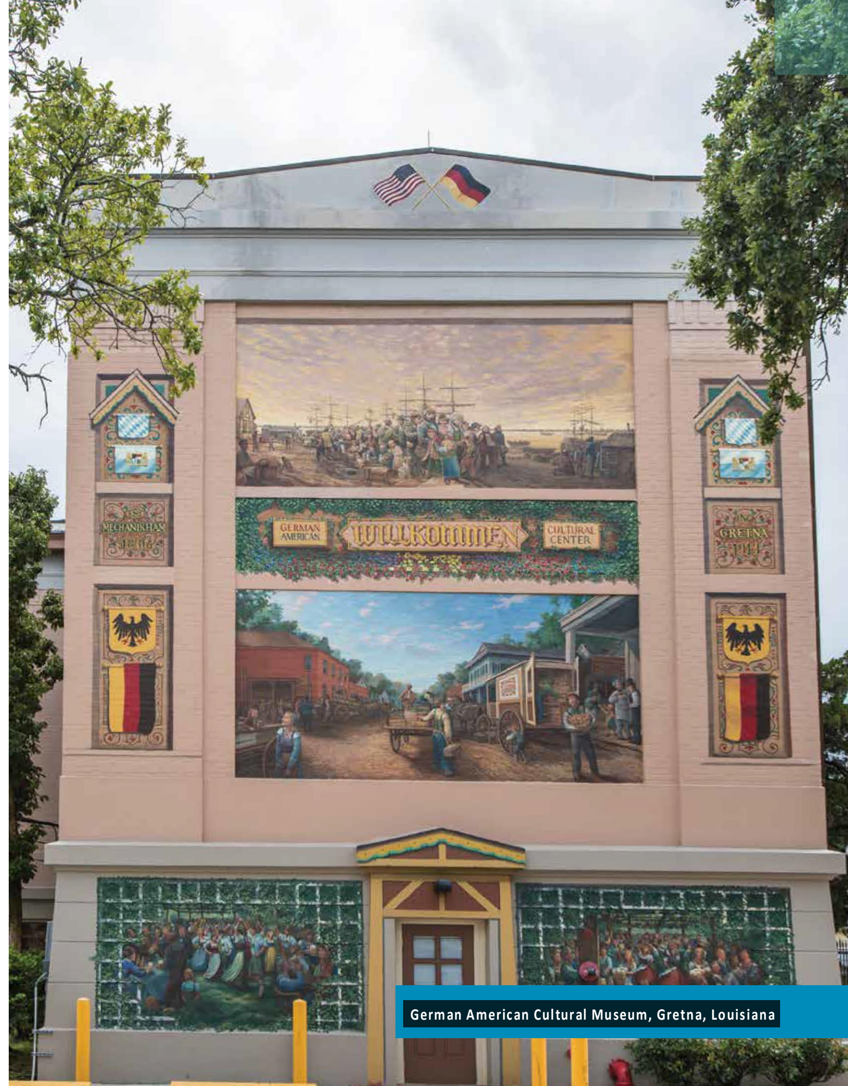
German American Cultural Museum, Gretna, Louisiana