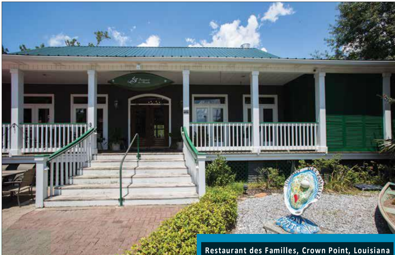
Restaurant des Familles, Crown Point, Louisiana