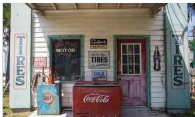
Historic Rivertown, Kenner