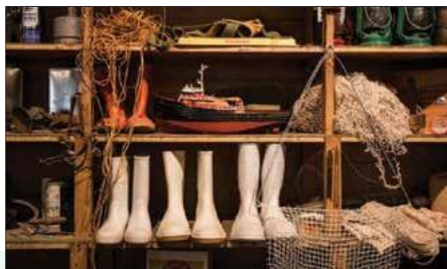
Westwego Historical Museum

With Jefferson being home to some of history's most outlandish characters such as Huey P. Long and Jean Lafitte, the history of Jefferson Parish is sure to intrigue you. Learn the history of Jean Lafitte and his controversial contributions to the Battle of New Orleans, and discover the history of Huey P. Long and the significance of the Huey P. Long Bridge. Jefferson is also home to three historic districts, Kenner, Gretna and Westwego.