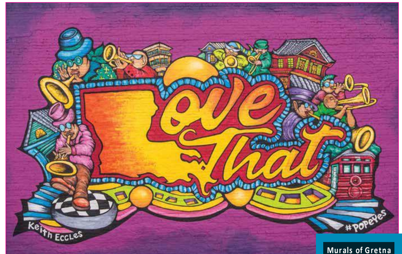
Murals of Gretna