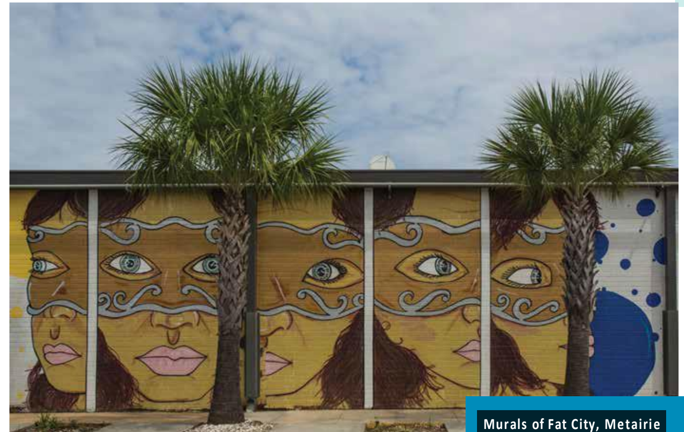
Murals of Fat City, Metairie

Sala Avenue is the city's Historic District and is currently being redeveloped for the enjoyment of locals and visitors. The Westwego Farmers and Fisheries Market, opened summer 2008, features fresh produce, seafood, arts and crafts Wednesday and Saturday from 9am to 1pm. The Westwego Historic Museum is located in the century-old fisherman's exchange building and features an old-time hardware store and completely furnished upstairs living quarters with antique furniture.