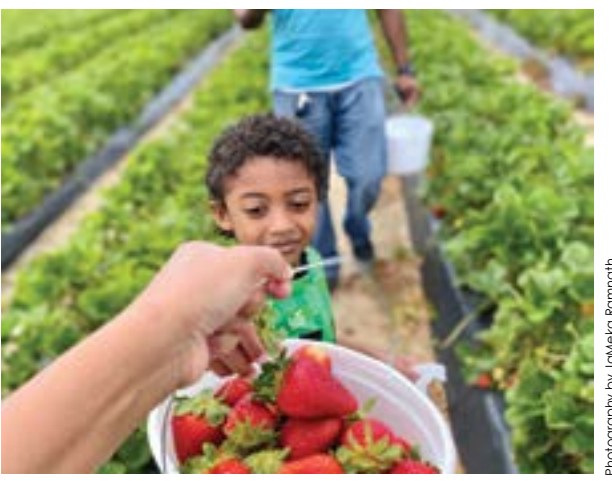
гпогодгарпу ву замек

Connect to our local farms via the NC Farms App, click to download and enjoy farm fresh and locally sourced dining. www.visitncfarmstoday.com