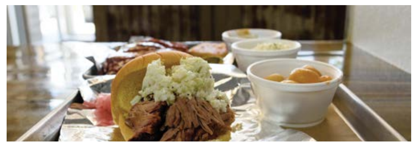
Visitors to Johnston County are fans of our barbeque, and we are too! Below find a selection of southern cooking and BBQ restaurants!