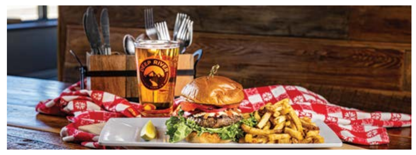
TABLE SERVICE DINING

For a taste of our dining options in Johnston County, the following list of restaurants represents a variety of flavors including Italian, Mexican, Asian and American. For a full list of restaurants in the county, visit johnstoncountync.org/restaurants .