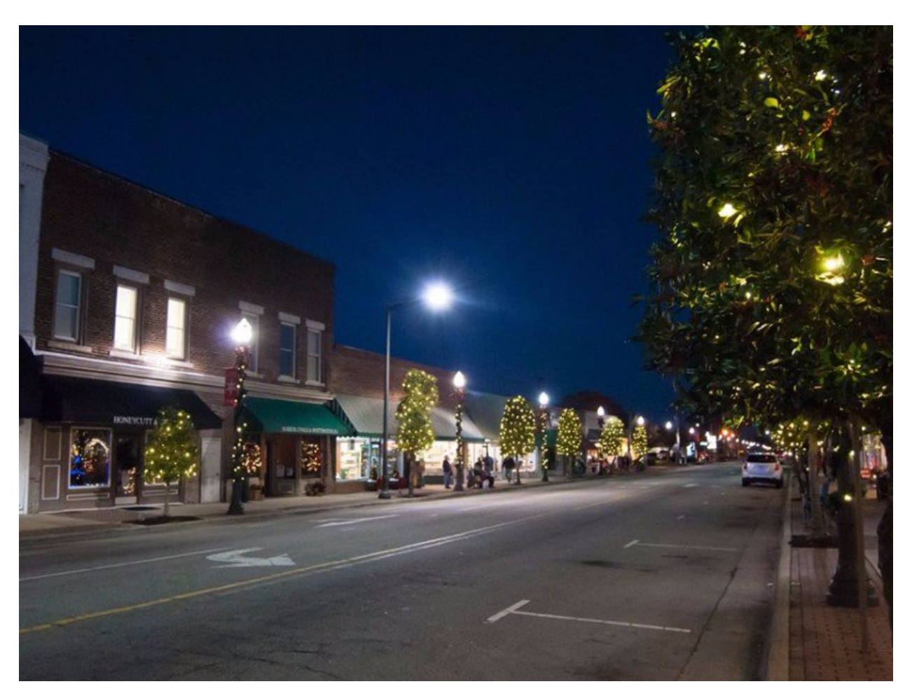
Lights in Benson, NC

specialty foods like strudel, bratwurst, sauerkraut, roasted nuts, Lebkuchen (gingerbread), almond shortbread cookies and the mulled spiced wine known as gluwhein, as well as Christmas ornaments and décor, arts and crafts, toys and other handmade products. Visitors can also enjoy live German music and performances, family-friendly holiday movies and of course, a visit with Santa, then explore Charlotte's other top attractions.