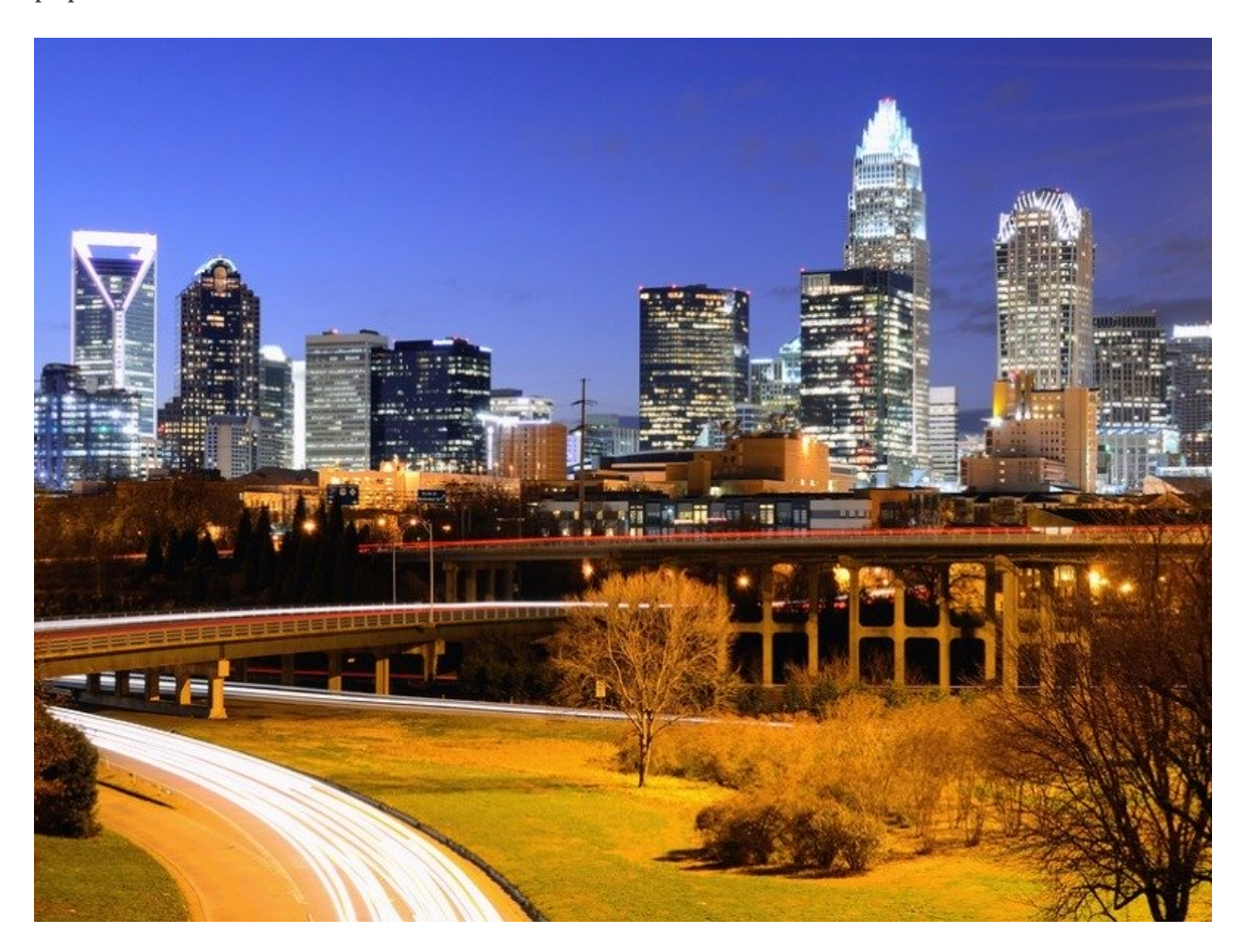
Financial District of Charlotte

Perhaps the most <u>famous Christmas town in North Carolina</u> is McAdenville. After all, it has been dubbed "Christmas Town U.S.A." and receives visitors from all over the country. Each year, the residents of McAdenville turn their small town into a glowing Christmas scene that stretches for 1.3 miles and includes over 500,000 red, green and white lights. The display begins with a special lighting ceremony where a local elementary school student pulls the big switch. Since the lights are controlled by automatic timers, they will go off on time no matter how many people are still in line, so make sure you schedule your visit appropriately. And there WILL be a line... a long one since McAdenville is one of the most popular Christmas attractions in the state.