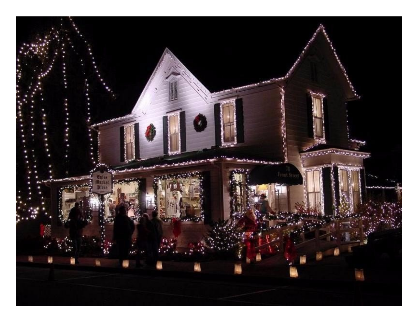
Lights in Dillsboro, NC Dillsboro