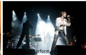
to perform hits