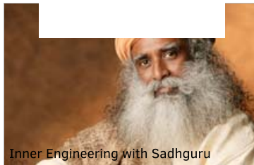
Inner Engineering with Sadhguru