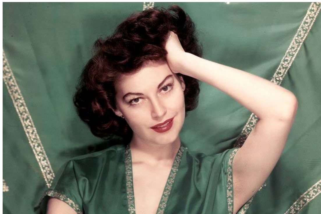
A young Ava Gardner in a green dress.