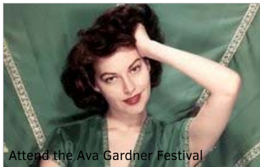
Attend the Ava Gardner Festival