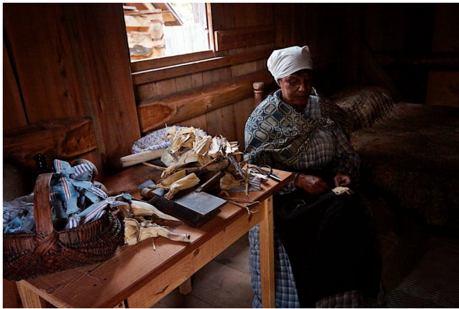
Island Farm is a living history site interpreting daily life on Roanoke Island in the mid-1800s.