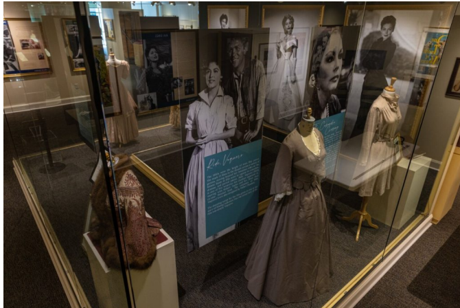
The Ava Gardner Museum is filled with attractions related to the famous actress.

Put Boxyard RTP on your Durham radar. Turning one-year-old, this is where industrial meets inventive. The result is a palette of unique flavors, local products, sounds, and one-of-a-kind experiences. It's all set against a backdrop of used shipping containers. discoverdurham.com