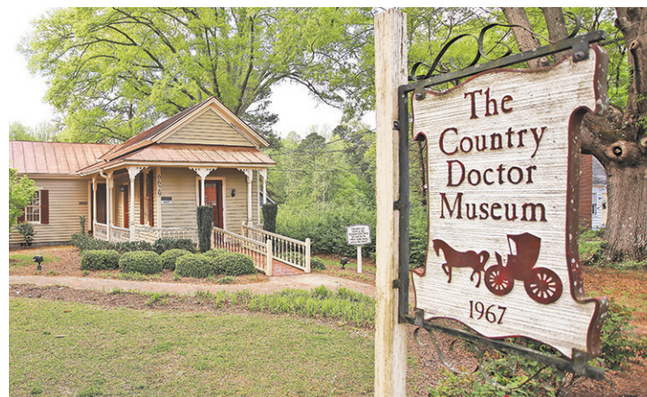
EXPLORE NASH COUNTY

The collection of the late Raleigh plumber-philanthropist Brady Jefcoat is divided into six categories that include early development, historic farm and agriculture, wildlife, entertainment, Native American artifacts and miscellaneous treasures. The museum houses such oddball items as a dog-powered washing machine and a sofa from the film Gone With the Wind .