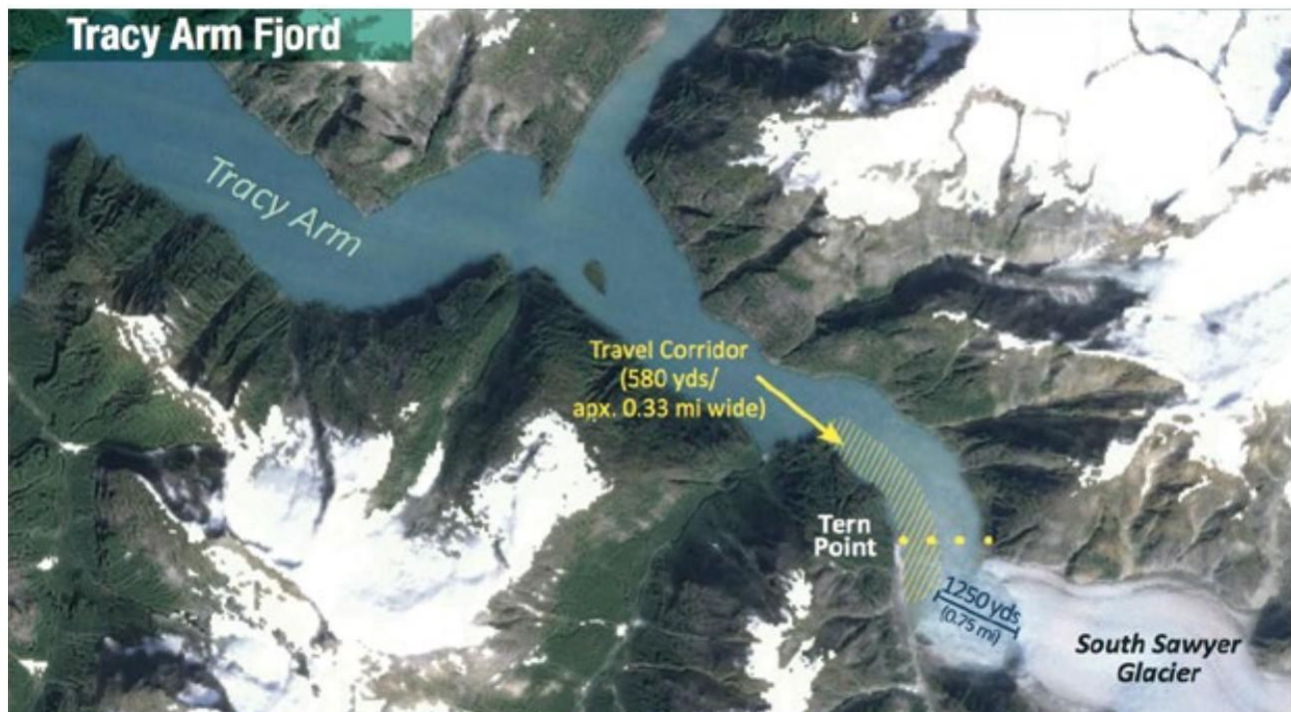
EXHIBIT A NOAA Harbor Seal Approach Guidelines in Glacier Fjords for Vessel Operators

**2015 map...South Sawyer Glacier position may have changed. Vessels advised to maintain recommended travel corridor and distance from the encountered glacial face.