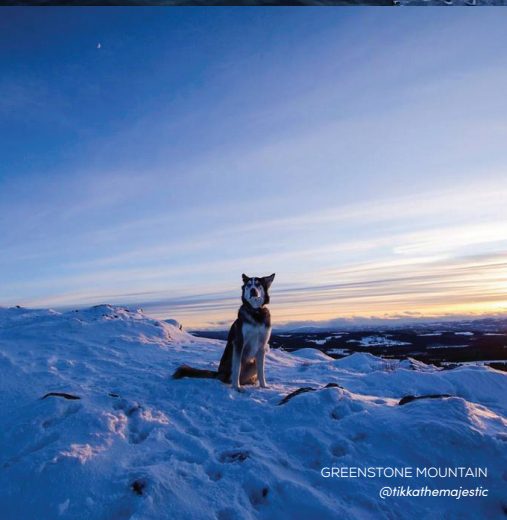
GREENSTONE MOUNTAIN @tikathemajestic