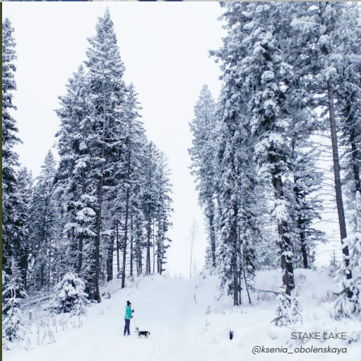
STAKE LAKE @ksenia_obolenskaya