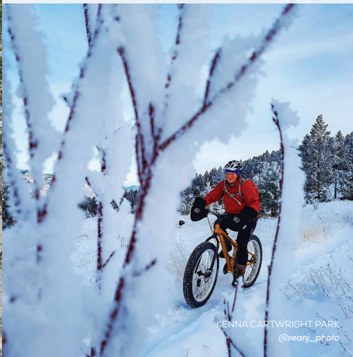
KENNA CARTWRIGHT PARK