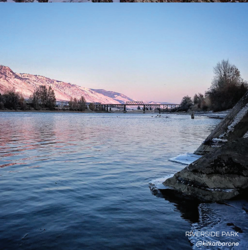
RIVERSIDE PARK @kikatbarone