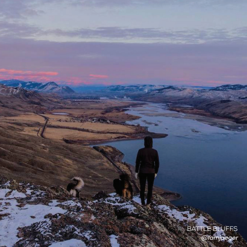
BATTLE BLUFFS @tamjager