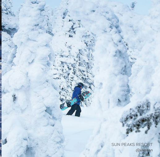
SUN PEAKS RESORT