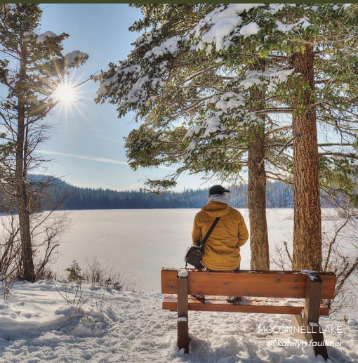
MCCONNELL LAKE @karolyn_faulkner