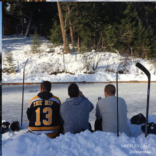
HEFFLEY LAKE @itzcorinne