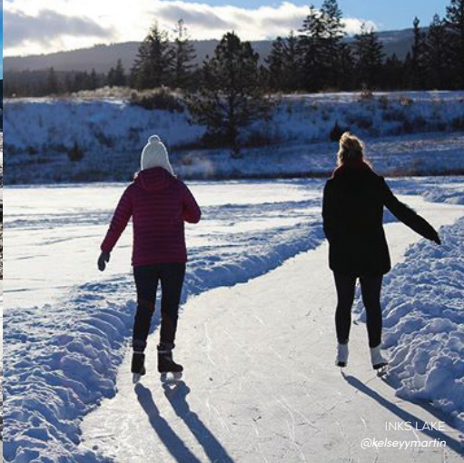
INKS LAKE @kelseymartin