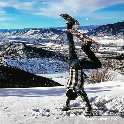
EMERSON VALE NATIONAL PARK @mountainman_miller