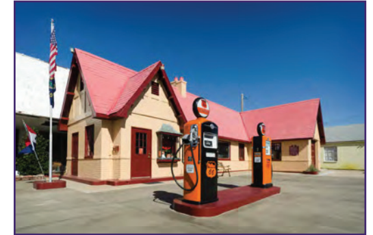
Visitor Center in Baxter Springs

adventure. Cruising on south through downtown, many of the buildings retain their original storefronts. There are murals that depict some of the area's history, including the early cow town days or buildings such as the 1870 Crowell bank building that was said to have been robbed in 1876 by Jesse James and Cole Younger.