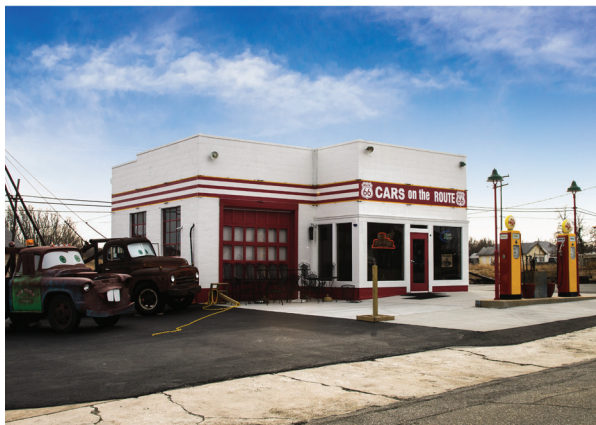
"Cars on the Route," Galena Home of "Tow Tater" the inspiration for Tow Mater in the Pixar movie "Cars"