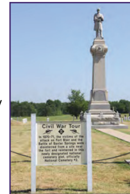
Baxter Springs City Cemetery Soldiers' Lot