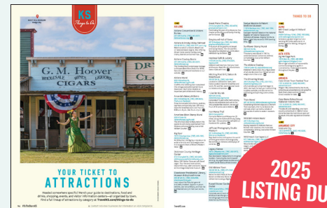
Sample layout only. Layout subject to change.