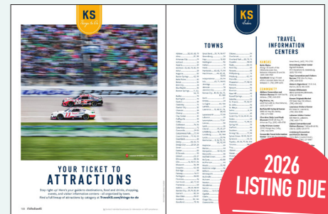
Sample layout only. Layout subject to change.