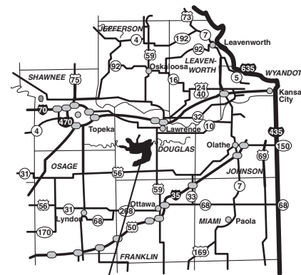
Clinton Reservoir, State Park & Wildlife Area General Area Map

CG#3 - 260 camping pads total; 91 with 30 amp electricity and water, 31 with 50 amp electricity and water. $2.50 extra prime site charge.