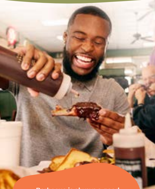
Barbecue is always a good idea, if you are in KCK.

Visit Kansas City Kansas is the official destination marketing organization for the city of Kansas City. Our mission is to generate economic impact through tourism by promoting Kansas City, Kansas as a destination for visitors, conventions, and sporting events.