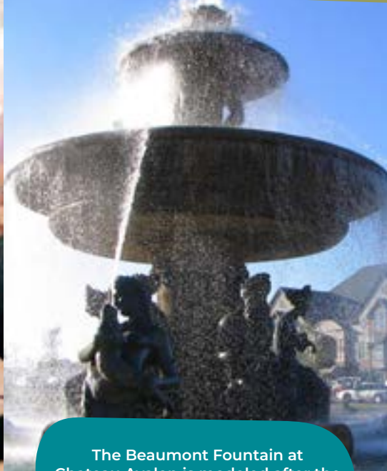
The Beaumont Fountain at Chateau Avalon is modeled after the Fountain de Mers at the Place de la Concorde in Paris, France.